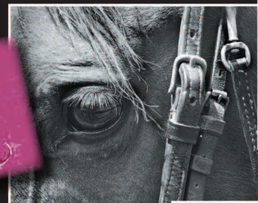
Windy's Eye, photograph by Wen Saunders

175 Pagosa Street & 2nd (ASPEN GROVE PLAZA) www.artisansofthesouthwest.com