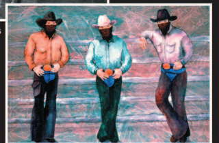
Don't Fence Me In, watercolor, pen & ink by Sandy Applegate

Fine Art Wine Tasting Meet Artists Local Artist Art Workshops