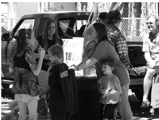
Friends and family were in attendance at the first SLV Tea party held in Cole Park in Alamosa.