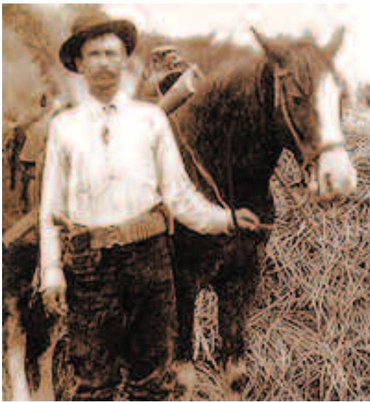
Charlie Siringo, Investigator, Cowboy and author of this continuing piece!

We sat up all night and next morning when