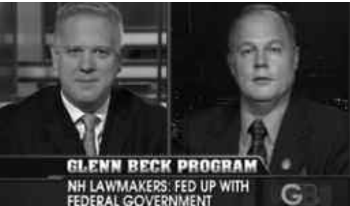
Glenn Beck begs you to watch this graphic report on the economy... http://www.youtube.com/watch?v=YDEe0Ai6lTM

More video info on this is at www.nhliberty.org , and many other topics Glenn Beck is presenting that will shock you can be found at foxnews.com . Even some in the media are waking up to the truth and taking action!