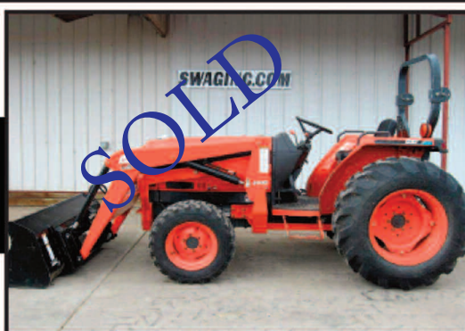
2000 Kubota L3710GST, 877 hrs, 4x4, 37 hp, new Rhino loader ..... $14,900