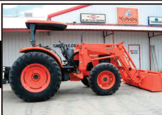
2007 Kubota M105SHD, 687 hrs, 105 hp, 4WD, loader, canopy, hydro shuttle $29,900

sales * rentals * parts * service 39927 Hwy 160 * Bayfield, CO 970-884-4101 * 800-218-2347 www.swaginc.com